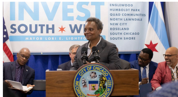
Mayor Lori Lightfoot speaks in October at an announcement of the INVEST South West Initiative.

Submitted to Mayor-elect Lori E. Lightfoot • May 17, 2019