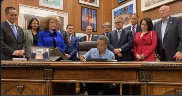
Suburban lawmaker introduces bill to end aldermanic prerogative in Chicago A DuPage County lawmaker introduced a measure Tuesday designed to strip Chicago aldermen of decision-making power over ward-level issues, saying... thedailyline.net

New from @thedailylinechi as part of the Lens on Lightfoot collaboration: A DuPage County lawmaker introduced a measure Tuesday designed to strip Chicago aldermen of decision-making power over ward-level issues