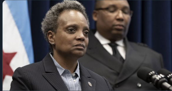
Residents await Lightfoot's master plan on affordable housing as citywide c... To hear Mayor Lori Lightfoot tell it, none of her administration's efforts to tackle the intractable problems facing Chicago stands a chance of success ... thedailyline.net

Residents await Lightfoot's master plan on affordable housing as citywide crisis deepens // the latest Lens on Lightfoot story is out from @thedailylinechi